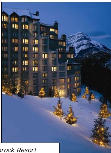
The Rimrock Resort Hotel Banff, Alberta